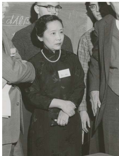
Fig. 2 Chien-Shiung Wu in Columbia University (1958).