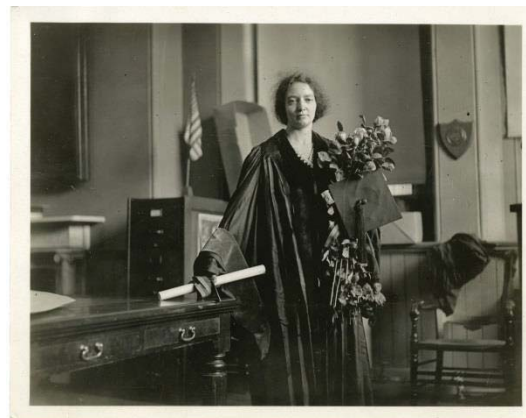
Fig. 10 Irène Curie, 1921.

Irène passed away on March 17, 1956, at age 58 from leukaemia, probably because of exposure to radioactivity in her work [27]. Just like her mother, she is certainly a great inspiration to women, who are encouraged and influenced by her achievements in science and politics.