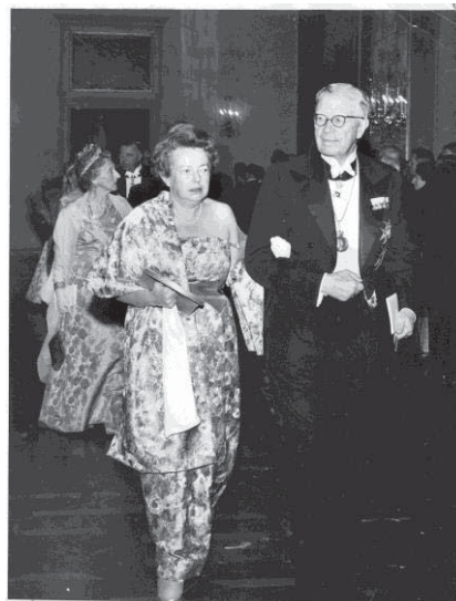
Fig. 7 Maria Goeppert-Mayer (1906–1972), walking in to the Nobel ceremony with King Gustaf Adolf.

An award was created in her name by the American Physical Society to honor young women physicists [18]. Today, her discoveries in double-photon absorption have been applied in dermatological diagnoses [14].