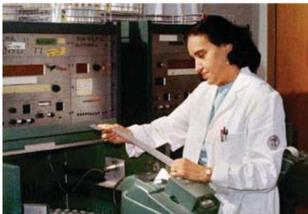
Fig. 5 Rosalyn S. Yalow, winner of a Nobel Prize in Physiology or Medicine, at The Bronx Veterans Administration Medical Center.