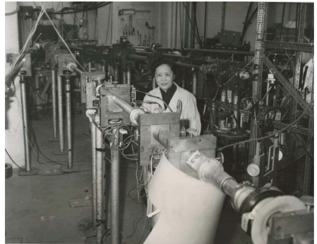
Fig. 3 Chien-Shiung Wu in Columbia University (1963), where she worked as a professor.

Her namesake “ courageous hero ” truly describes someone with a brilliant mind, who has risen against all kinds of challenges to succeed in life.