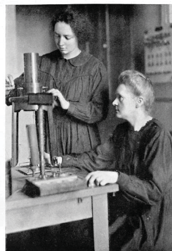
MME CURIE AND HER DAUGHTER IRÈNE, 1925

They were married in 1926 and had two children. Irène perfectly assumed her role both as a researcher and as a mother. Just like her parents, Irène and Frederic worked as a husband and wife team, focusing their research on the atomic nuclei structure.