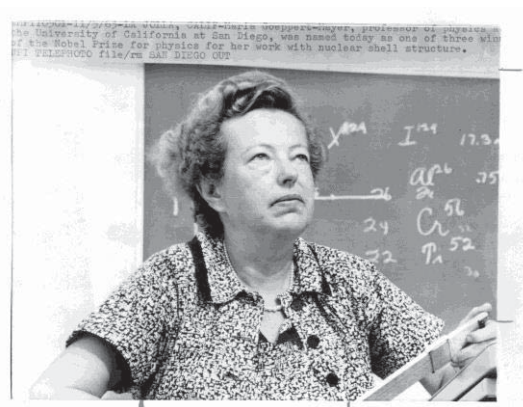
Fig. 6 Maria Göppert-Mayer, 1963.

When Maria and Joseph got engaged, she considered quitting her career to become a housewife, but her husband convinced her to keep on working [9]. They got married in January 1930, and she finally earned her PhD a few months later [15].