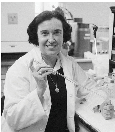
Fig. 4 Rosalyn S. Yalow at the Bronx Veterans Administration Hospital (1977).